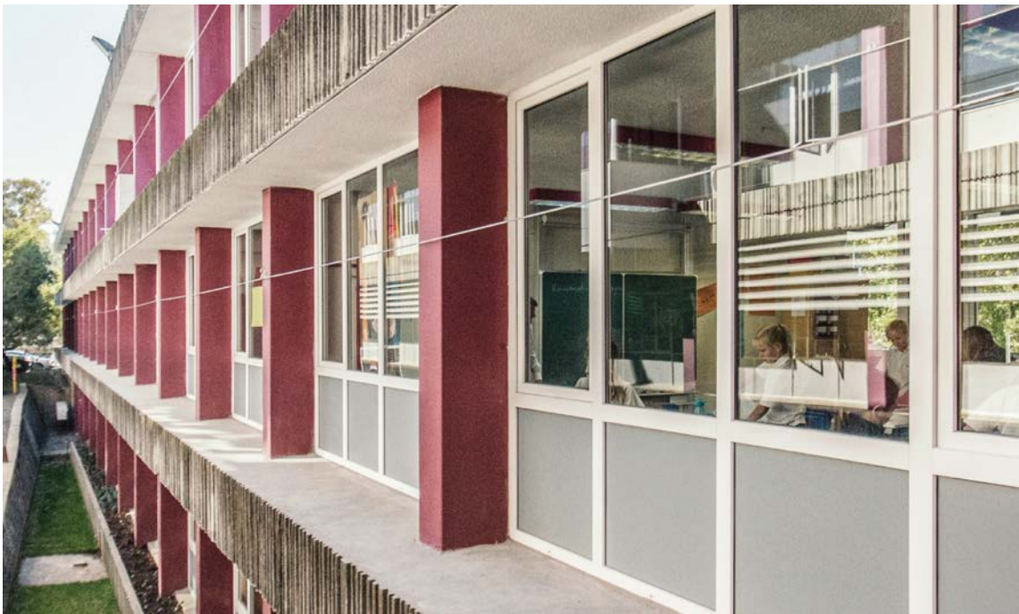
Deutsche Internationale Schule Johannesburg