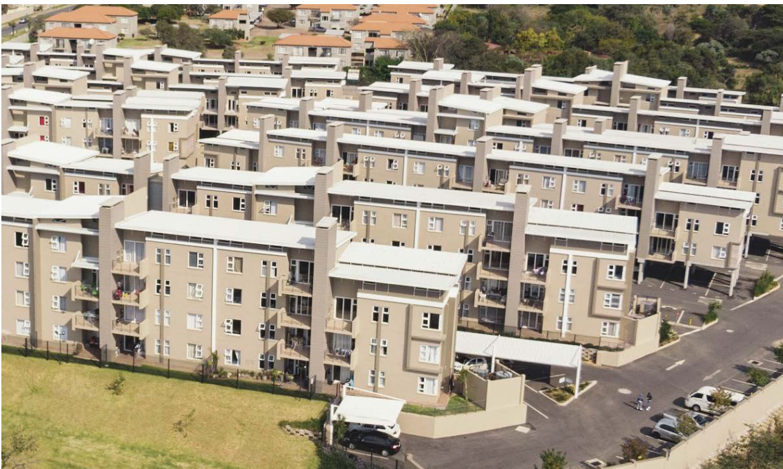
Northgate Heights, Johannesburg