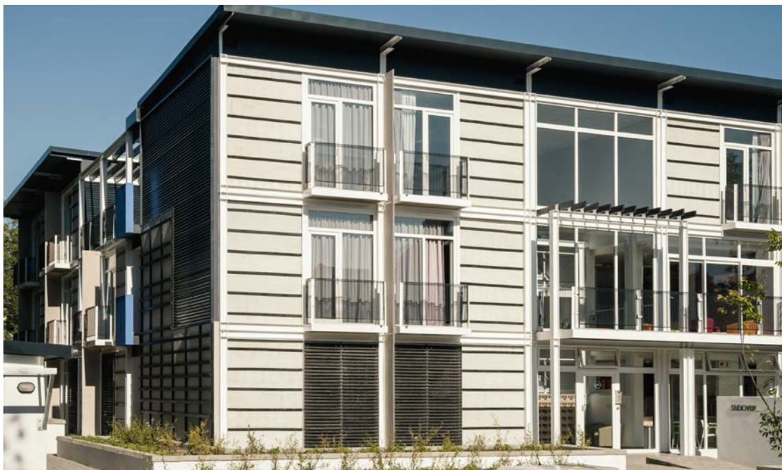
Student accommodation, Stellenbosch

REHAU's uPVC window and door systems are used throughout the whole range of commercial buildings. From schools to hospitals and housing developments, our products are preferred because of the many advantages they offer, making them an ideal choice for the Architect, Developer and Quantity Surveyor.