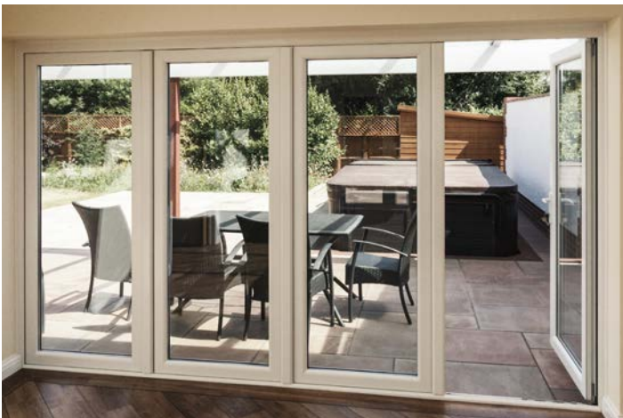
Securi Slide & Fold door