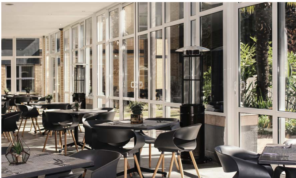
Holiday Inn OR Tambo