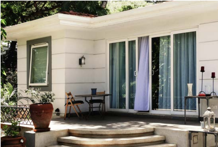
Traditional sliding door

Whether you need a patio or residential door, we have a range of doors that will thrill you. Our star: the Securi Slide & Fold door, a sliding – fold away door that is essential for every safety-concerned home owner.