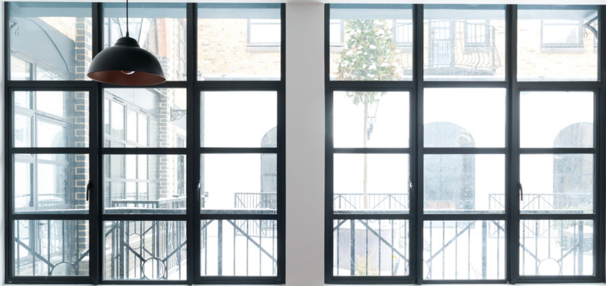
Images shown illustrate a type of application suitable for the product and are not binding in technical specification or detail.