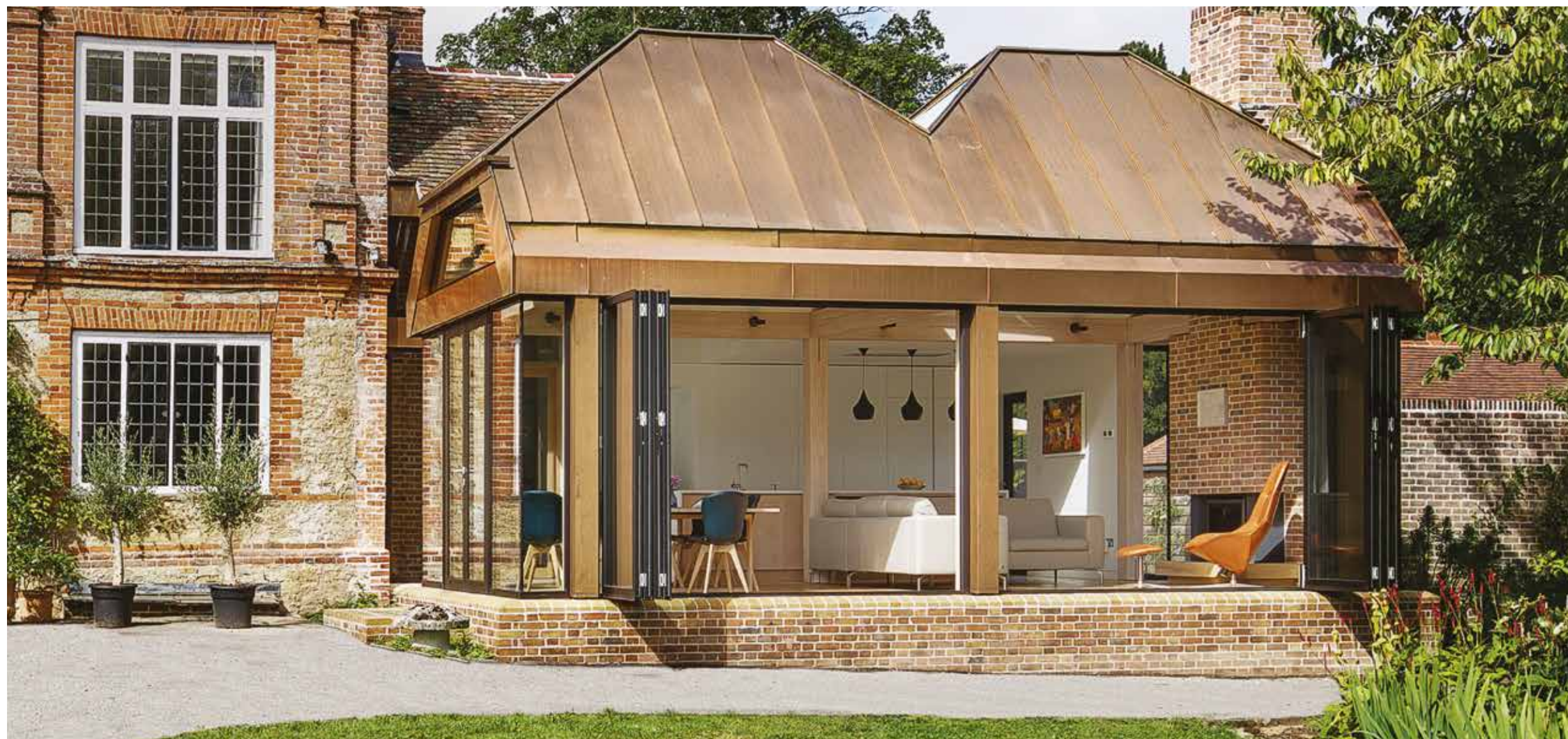
Enjoy a fabulous open air experience