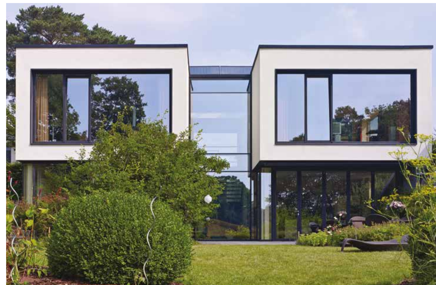
Perfectly proportioned windows enhance architectural brilliance