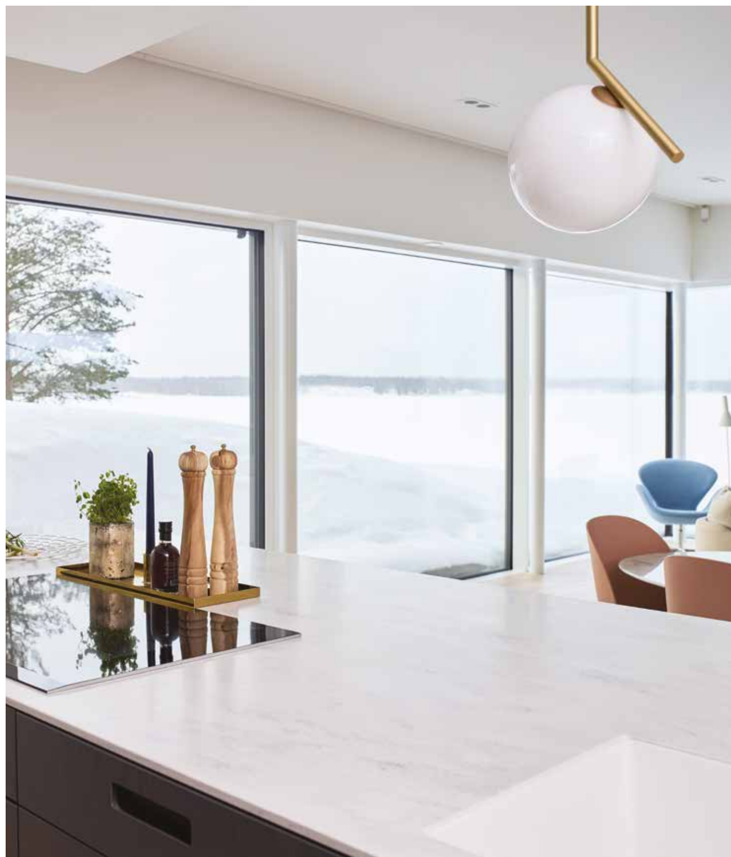
Excellent thermal insulation means you'll always stay warm when it's cold outside