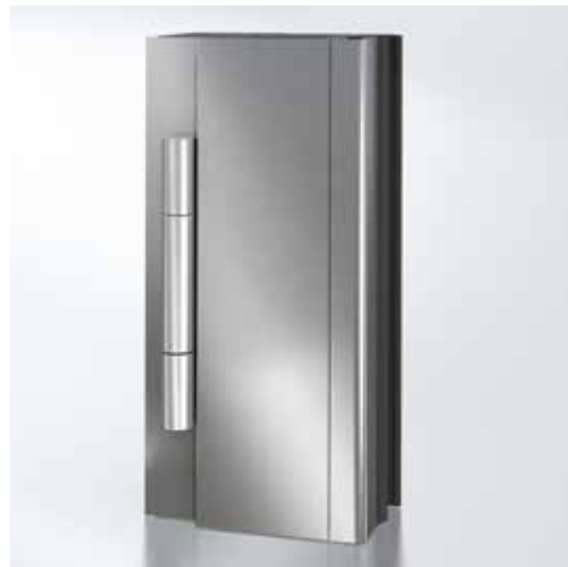
Slim-line barrel hinges with concealed fixings merge seamlessly into the profile