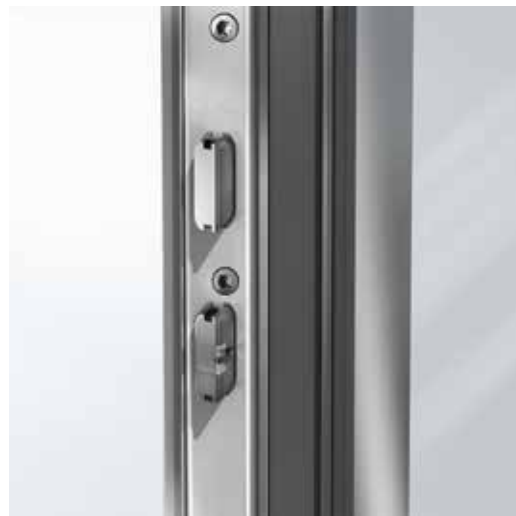
Schueco SafeMatic lock offers convenience and security