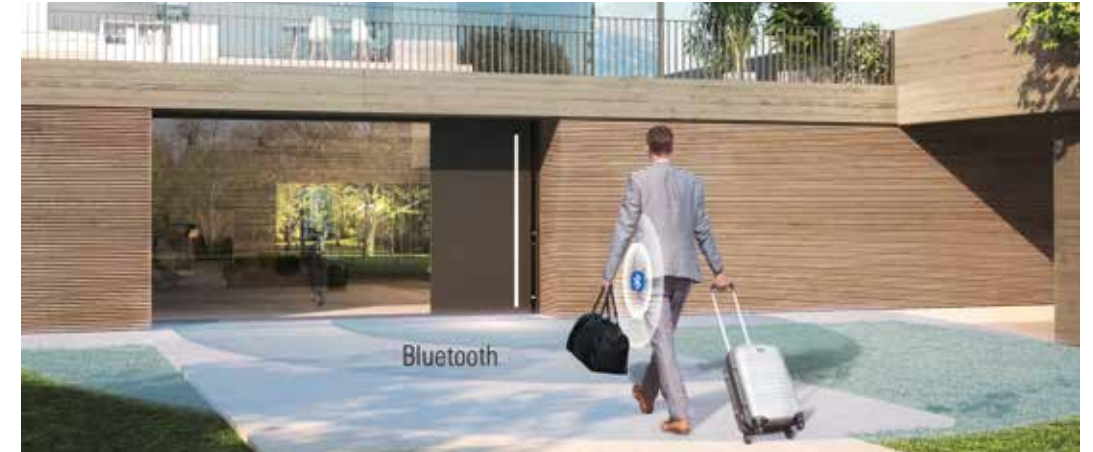
Schueco BlueCon unlocks the door automatically from a distance of 4 metres

The ultimate in domestic luxury, Schueco's TipTronic mechatronic window opening system is an option you may find hard to resist.