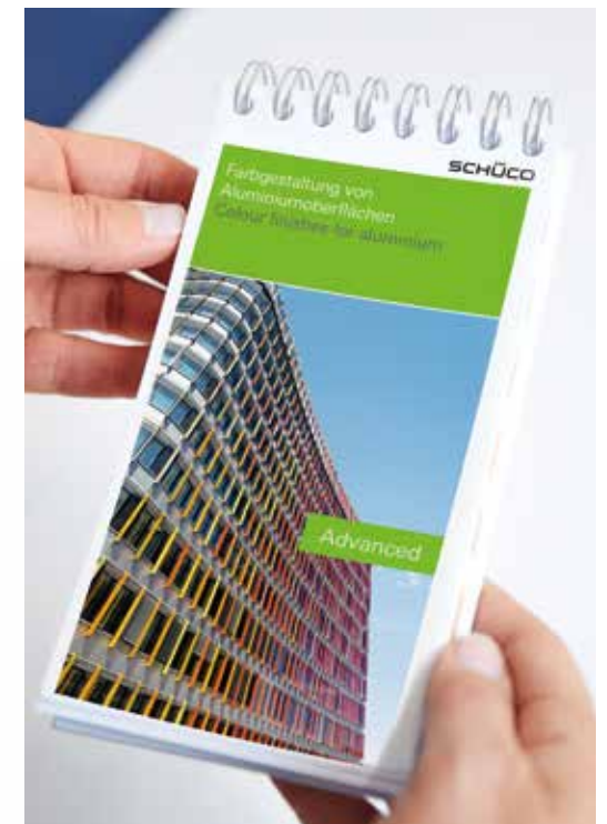
Real choice from the Schueco range of colours and finishes