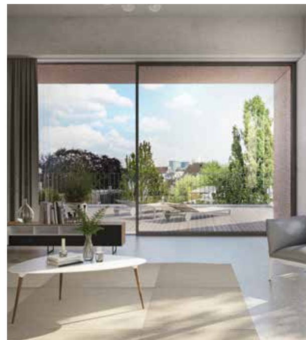
Slide a Schueco door open to enjoy more than the view