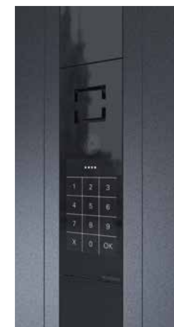
Keyless security access