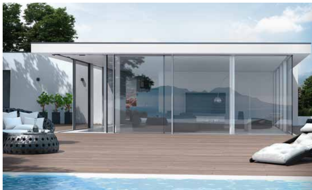
A stylish and contemporary look, courtesy of Schueco

This means you can enjoy the drama of large-scale clear glazing, while still staying warm and comfortable on cold winter days.