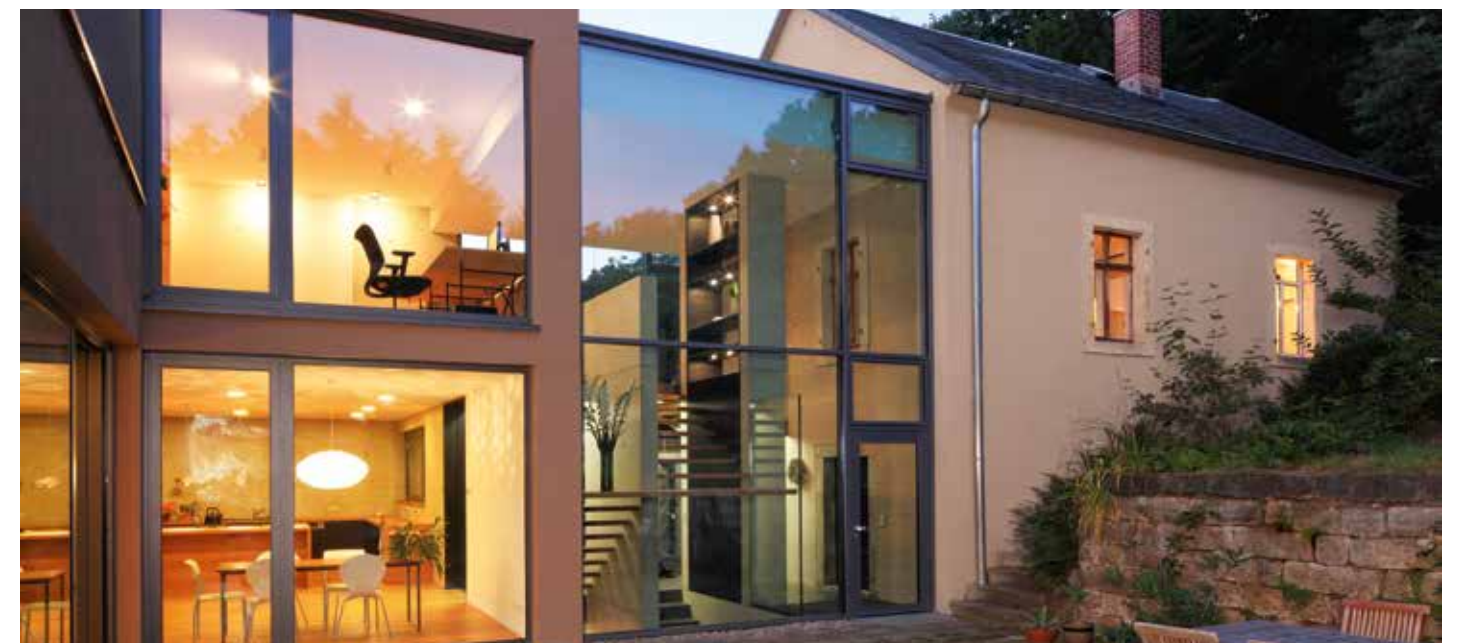
Schueco highly-insulated façades are just one design option