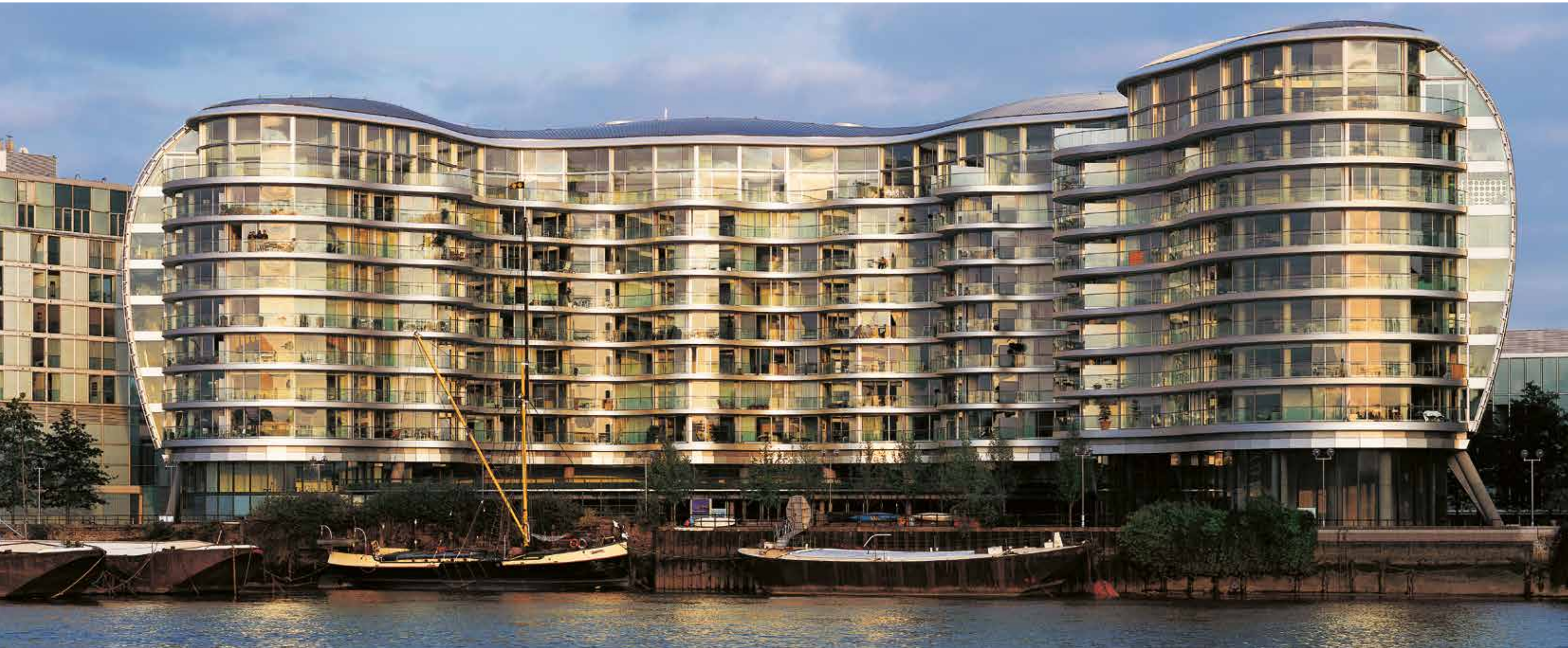
Albion Riverside, London, designed by international architect Foster + Partners and featuring Schueco systems

The systems we produce for the residential market are only one part of our business. Founded in Bielefeld, Germany, in 1951, we are a global company responsible for the aluminium façades, windows and doors on many of the world's most prestigious buildings.