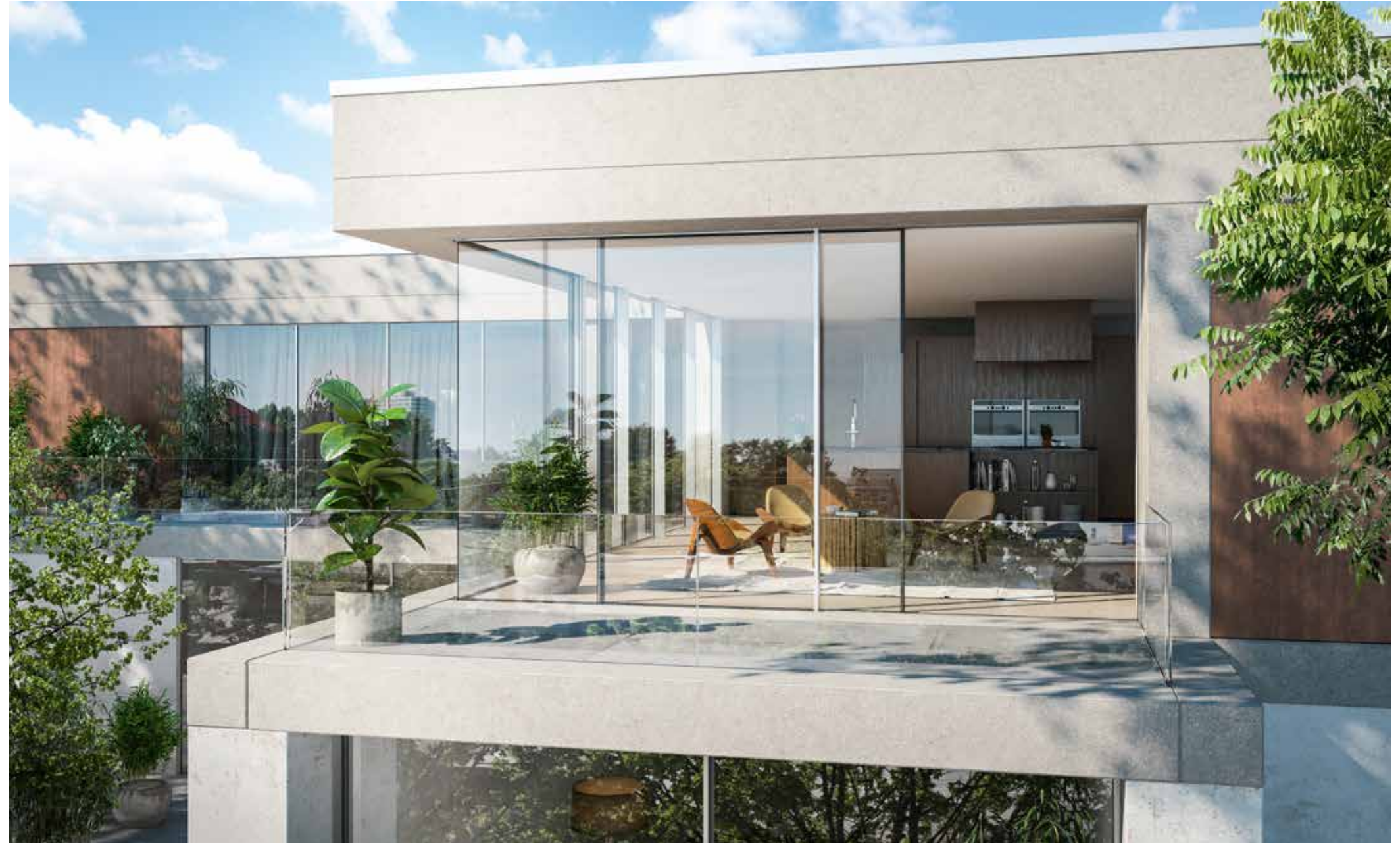
Panoramic sliding doors are your window on the world

With access made particularly safe by a threshold which lies completely flush, these beautiful sliding doors are as functional and secure as they are stylish.