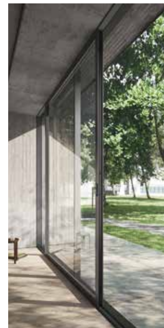
A Schueco lift-slide door has a low threshold

The moment you open a Schueco sliding door – whether it’s a straight slide or lift-slide – the solid feel of the frame and the easy-glide action make it clear you’re dealing with quality.