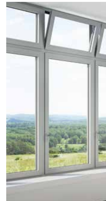
No more stretching to open fanlights