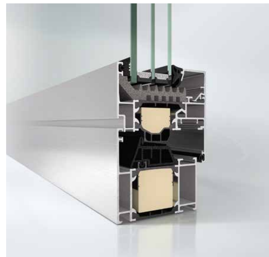
The super-insulated Schueco AWS 75.SI* window with triple-glazing