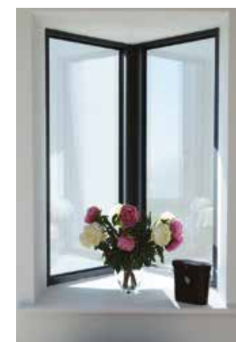
Every window makes a statement

We all know how important windows are to the look of a home and with The Schueco Contemporary Living Collection, it's never been easier to get these right.