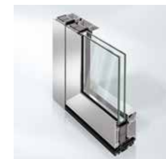
Schueco ADS 75.SI entrance door