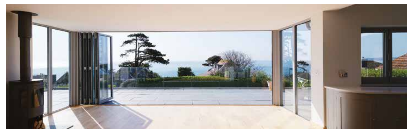
Have complete access to your terrace

In addition, being highly engineered and equipped with a multi-point locking mechanism, a Schueco folding door is exceptionally strong and dependably secure, despite its elegantly slim frames and narrow face-widths.