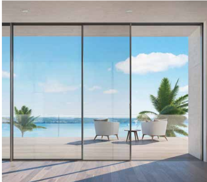
A panoramic sliding door lets you see the bigger picture

What's the best way to bring a house to life? Answer: flood it with light.