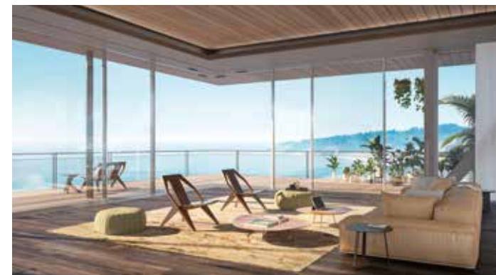
A completely open corner allows a clear view