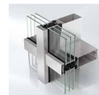
Schueco FW 50*.SI façade