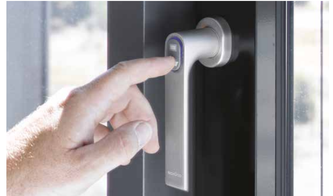
Automation at the touch of a button