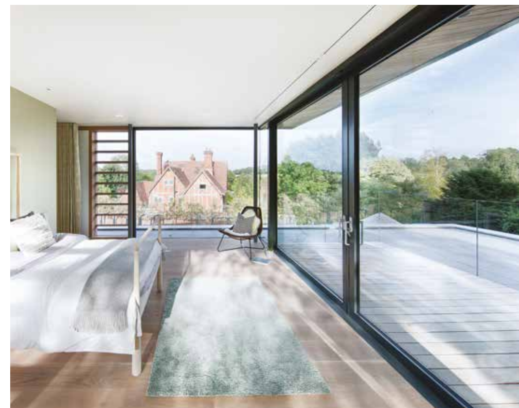
A Schueco highly-insulated sliding door means maximum comfort