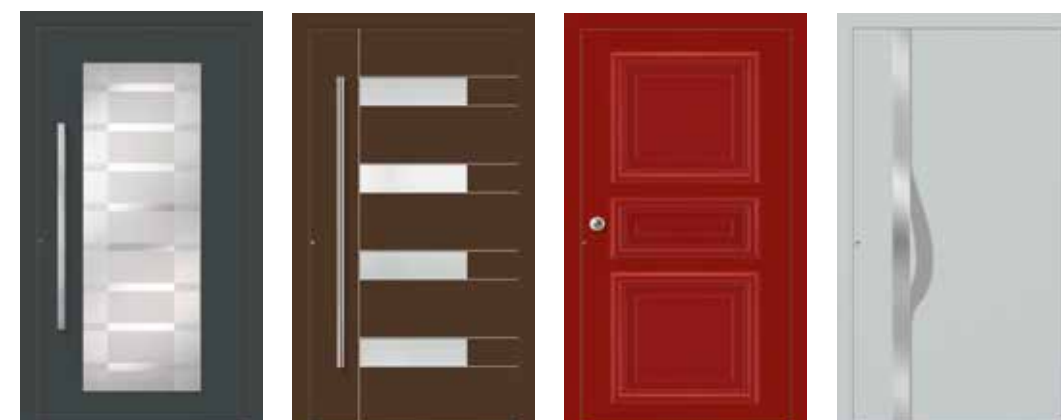
Some of the design options available to you

In short, a Schueco door is a perfect union of form and function, meeting the highest standards of design and comfort.