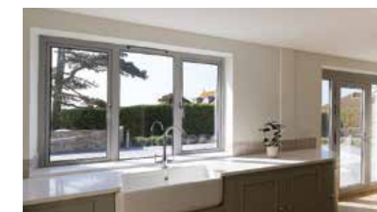
Form meets function, perfectly