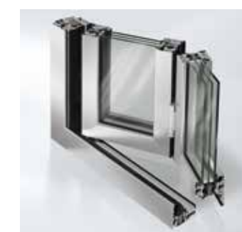
Schueco ASS 80 FD.HI folding door with triple-glazing