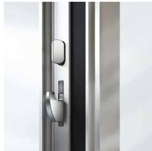
Multi-point locking: the ultimate security option