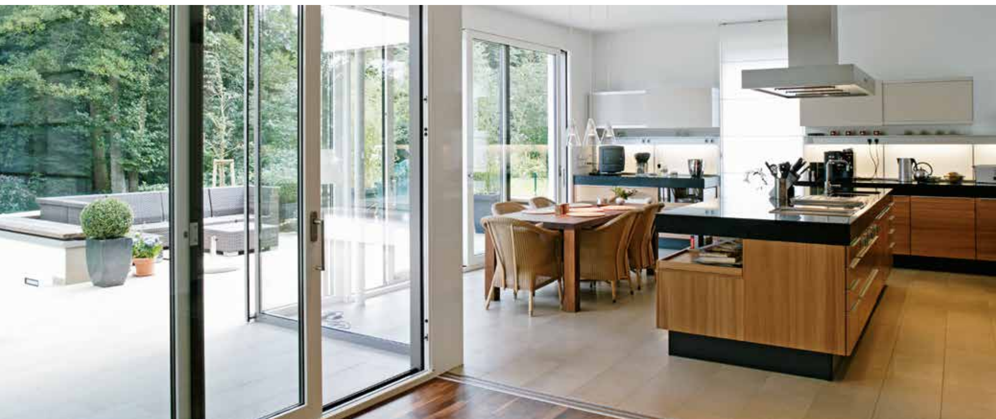
Let a Schueco sliding door bring light into your life