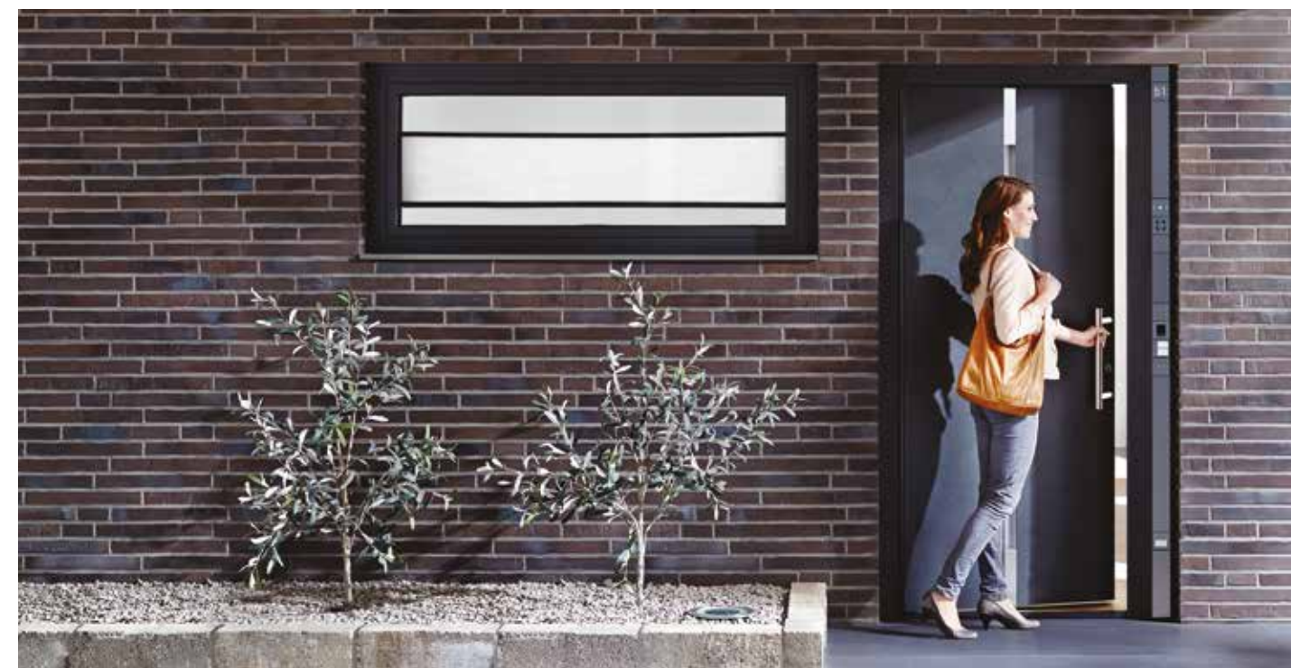
Customise your Schueco entrance door with stylish infill panels

When you visit someone's home, the front door is something you tend to use and forget. Yet its several active roles – as a barrier against the weather, as a guarantor of our security, as an indicator of our taste in design – make it an important feature.