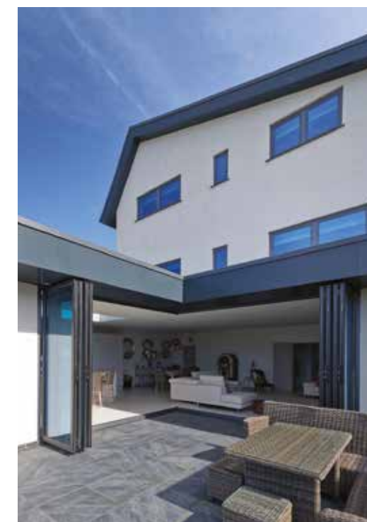
Without a corner post you can open up your entire patio

Everyone loves being in the open air when the sun shines.