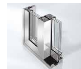
Schueco ASS 70.HI sliding door

And this not only means greater comfort and lower fuel bills, it also allows your home to do its bit for the environment by cutting the levels of CO 2 .