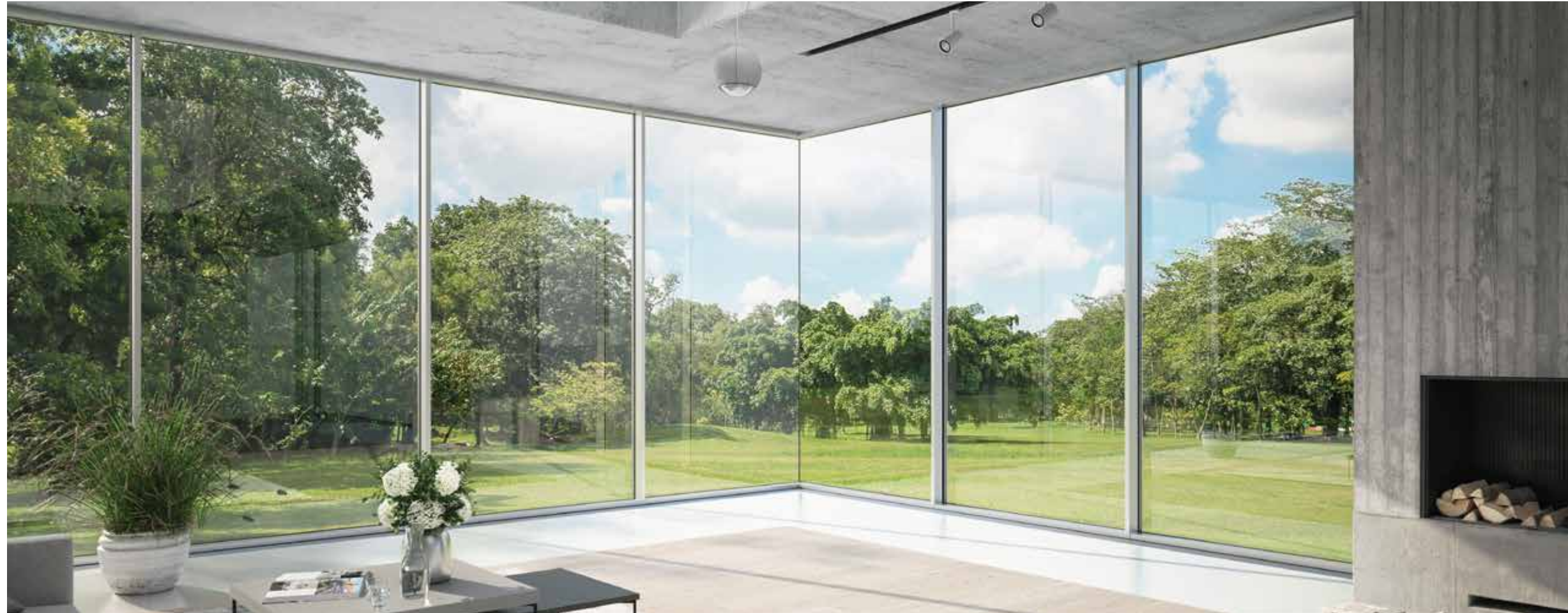
Narrow face-widths and a glass-to-glass corner: only a Schueco façade can offer this level of sophistication

As components in a building, aluminium and glass complement each other perfectly.