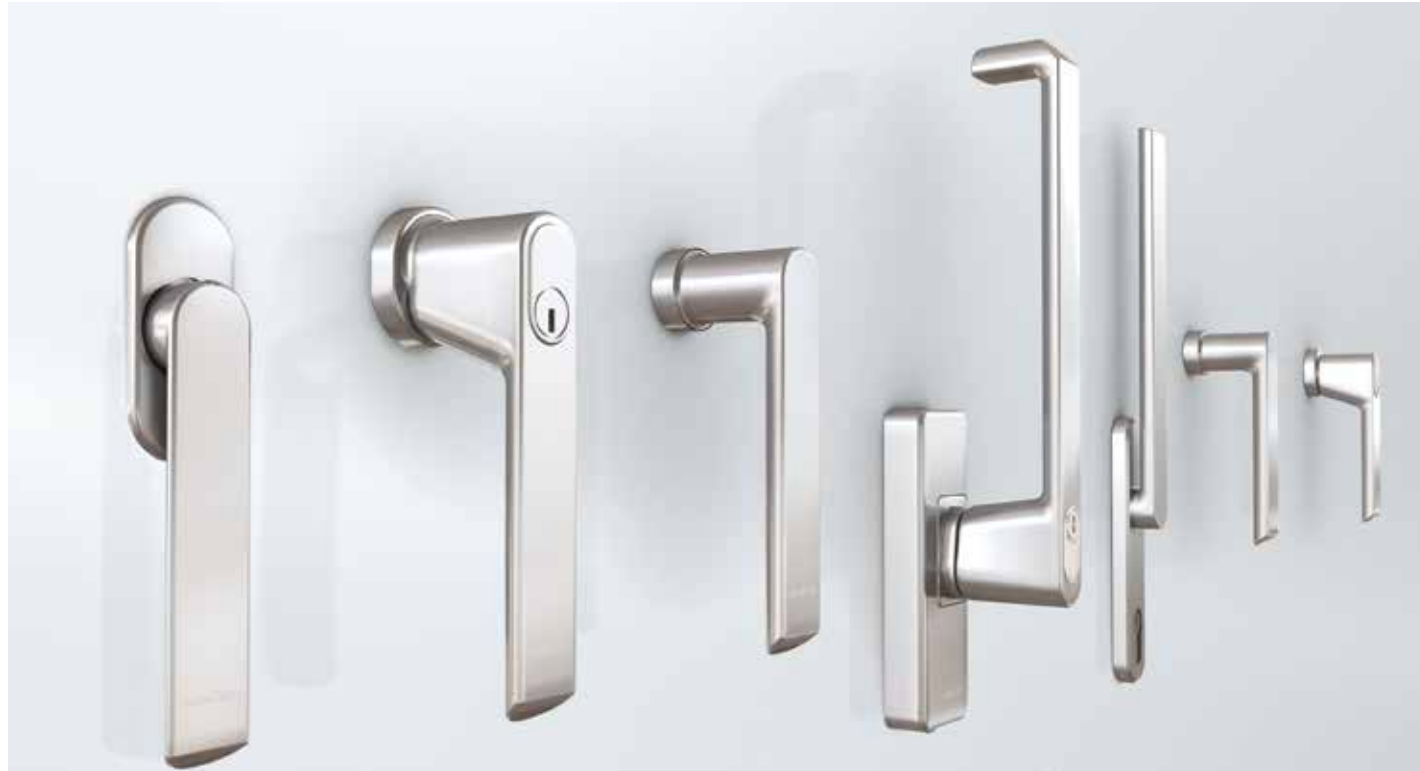
Minimalist design and a range of finishes give Schueco handles for windows and sliding doors their timeless appeal