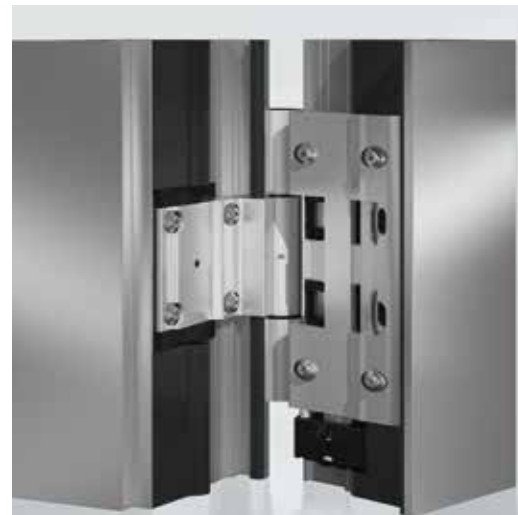
Completely concealed door hinges also offer excellent weather protection

Today's world is anything but certain, so one of our priorities is to ensure that your home always feels safe and secure.