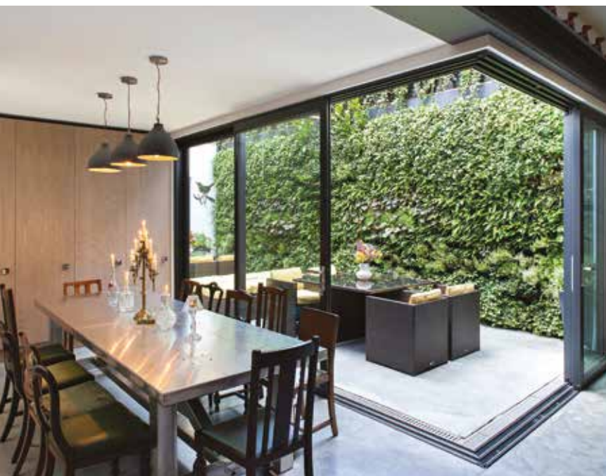
Schueco sliding doors without a corner post open up even more space